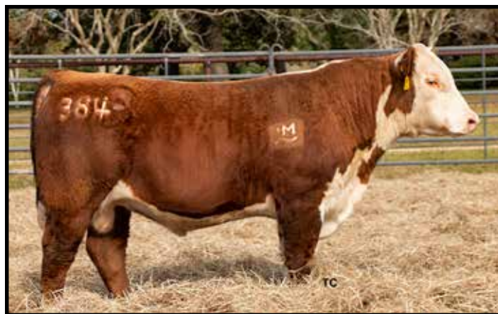
4M MR 9364 TRUST 384

• 384 is a big-time heifer bull that is still packed with power and some impressive genetics. He ranks in the top 6% for BMI and BI. His dam, a 100W daughter, ratioed 4 @ 105.5 for WW and 4 @ 101 for YW.