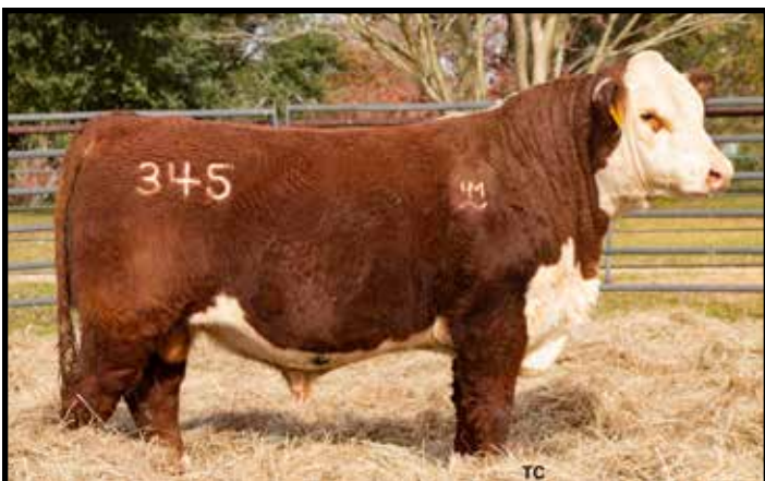
4M MR FRONTIER DEALER 345

• 342 is a dark red bull with plenty growth. He is sired by the well known /S Peerless 55000 bull, who was very productive for Shaw Cattle. If you are needing to fix some udder issues, he excels in indexes ranking in the top 6% for Udder and 3% for Teat. 342 ratioed a 101 for WW and 106 for YW. His dam records a progeny ratio of 7 @ 101.3 for WW and 7 @ 101 for YW.