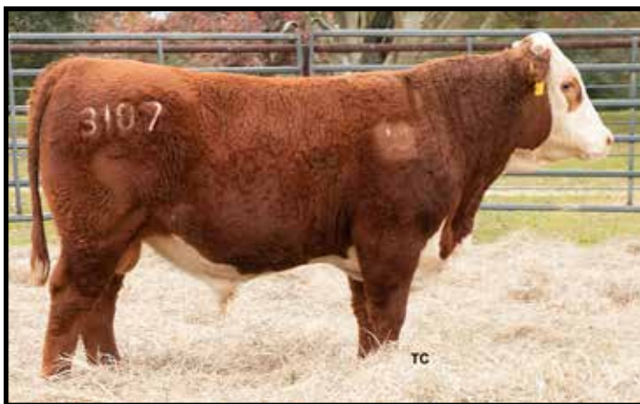
4M MR 2079 HOMETOWN GUY 3107