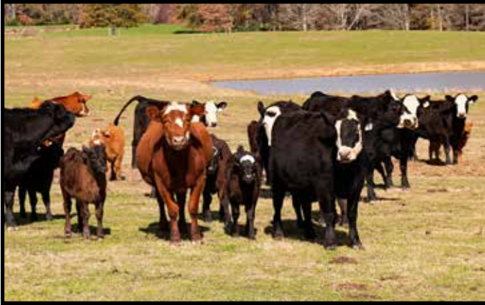
MG-4M BWF PAIRS

26- to 28-month-old F1 Black Baldy, Hereford/Angus. Calves are sired by Black & Red Angus Bulls. Calves born from October 15-December 15, 2023. Cows are exposed back to a Brangus bull starting January 1, 2024. Cows were last worked on December 16, 2023 with Virashield 6VL5HB and dewormed with Dectomax injectable. Calves were worked with Presponse HM, Inforce 3, Vision 8, Triangle 5 and dewormed Dectomax injectable.