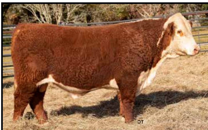
4M MR 666 VICTOR BOOMER 325

• 323 is flat out good! This horned, red legged 111 son goes back to an extremely productive 666 daughter who is truly impressing us. 323 ratioed 104 for WW. Don't overlook this guy.