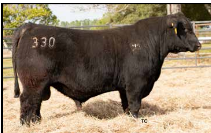
RM MR CHARLO BLASTER 330

• Heifer bull. 3X1 is rugged and stout with tons of longevity on the bottom side of his pedigree. Half brother to Lots 330, 394 and 350.