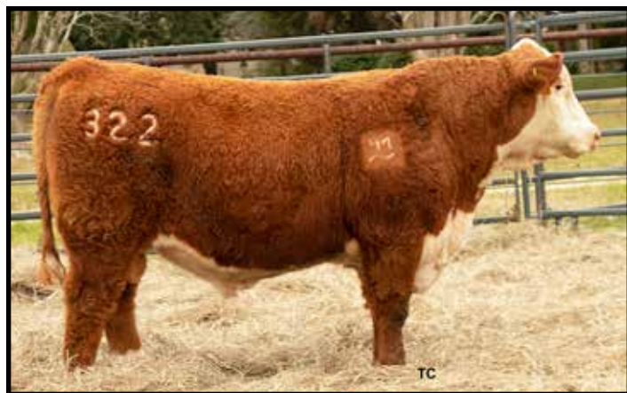
4M MR D2 DEALER 322 ET

• 322 is stout, rugged and carrying lots of red meat, just to describe a few of his attributes. We think very highly of this bull and it's easy to see why. No matter the direction of your operation, this guy is an asset. 322 ranks in the top 7% for Fat, 6% for REA, 14% for SCF and 15% for BMI and BI. Full brother to Lots 310 and 311.