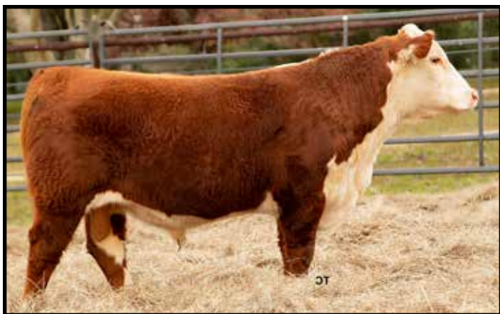
4M MR 9364 REMEDY 353