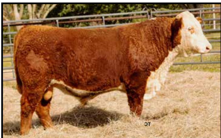
4M MR 9364 DOMINO 357

• 353 is a high performing 9364 son, that's out of a 12-year-old dam who is still in production. 353 is a heifer bull that's in the top 11% for Teat, top 16% for BMI and BI.