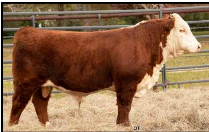
4M MR 111 DEALER 323