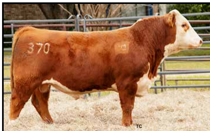
4M MR 2079 DOMINO 370

• 370 is a carbon copy of his sire, 2079. He is powerful, massive bodied, and good looking, also backed with the numbers to prove it! 370 ratioed a 109 for WW and 111 for YW putting him in the top 6% for WW, 4% for YW, 4% for SCF and the top 6% for BMI and BI. His dam records a progeny ratio of 3 @ 106 for WW and 2 @ 106 for YW. His sire, 2079, is putting his mark out there as well with 15 calves ratioing @ 107.5 for WW and 11 @ 106.5 for YW.