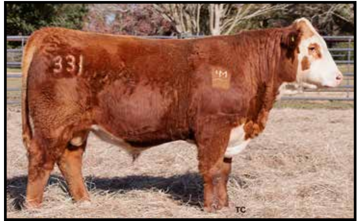
4M MR 252 DOMINO 331