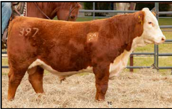
4M MR 9364 RIB EYE 397

• 394 is what a horned bull should look like. This complete 66589 grandson is also backed by some powerful genetics. He ranks in the top 20% for YW, 8% SCF, 7% Udder, 11% Teat, 11% BMI and 14% BI.