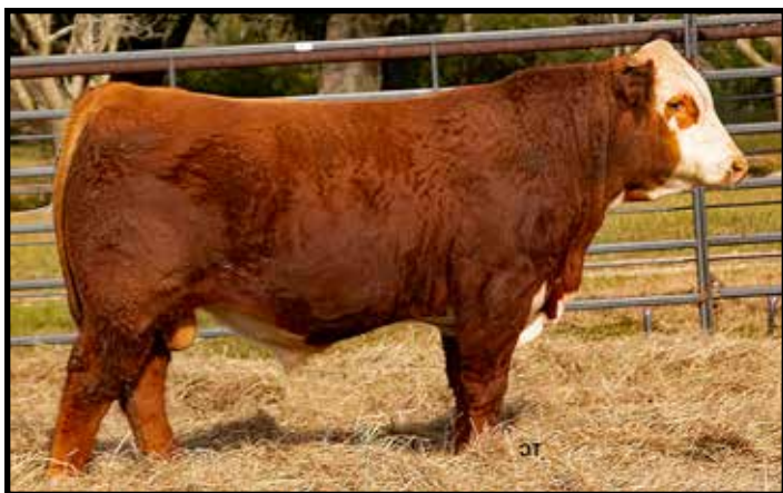
4M MR 2079 SENSATION 382

• 377 is a sleep all night heifer bull. If you can't tell yet, these 9364 sons are impressive. This bull is truly hard to put a hole in. He is in the top 1% for SCF, 5% Milk, and 1% BMI and BI.