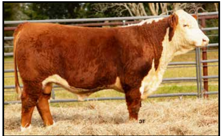
4M MR 111 ADVANCE 332