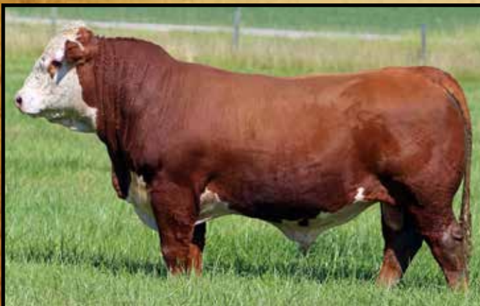
NJW 79Z 33B FORWARD 252F Sire of Lots 328, 331, and 349