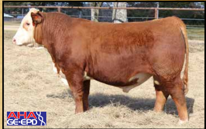
4M 66589 DOMINO 2079ET Sire of Lots 334, 339, 370, 382, 3104, and 3107