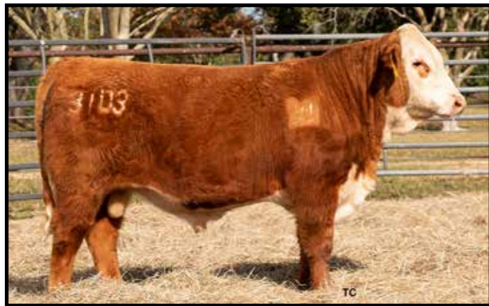
4M MR 322 RED COWBOY 3103

• 3103 is one of the last 322 sons in this offering. He is backed by 252F and 021 genetics. He is a heifer bull that is growthy and high performing. He ratioed a 104 for WW and 108 for YW. He ranks in the top 6% in Udder and 11% for Teat if you are needing to improve that in your herd.