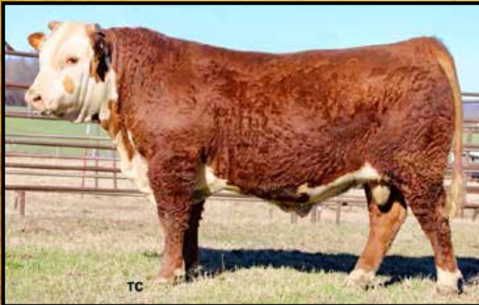
LF CHURCHILL 4075 111 ET Sire of Lots 309, 317, 323, and 332