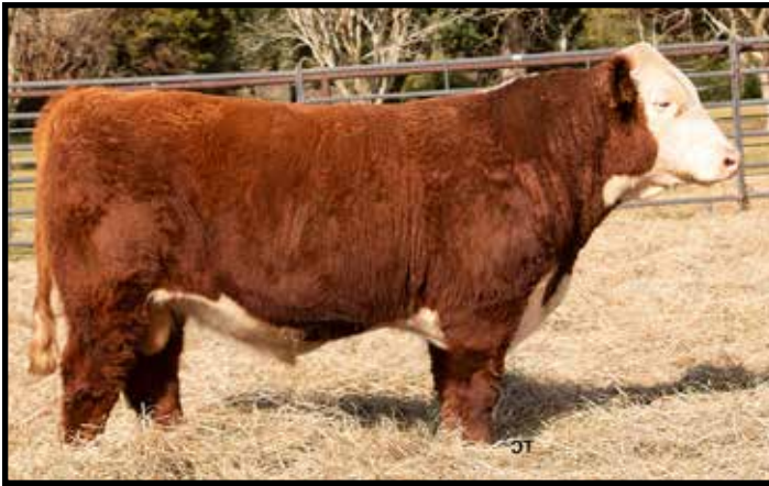
4M MR 322 PERFCT MAN 394