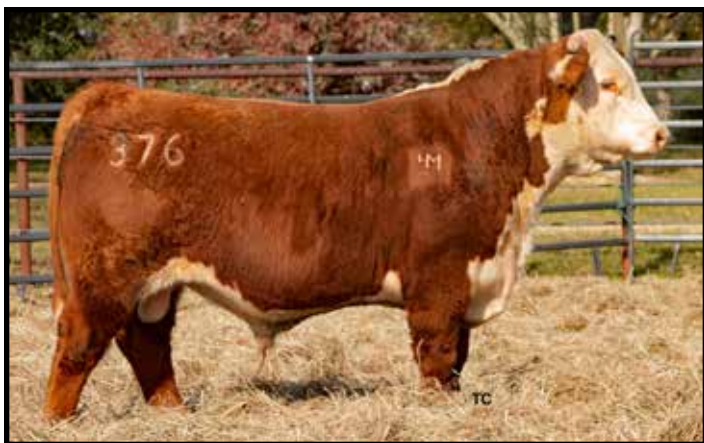
4M MR 9364 MR MAYBELL 376