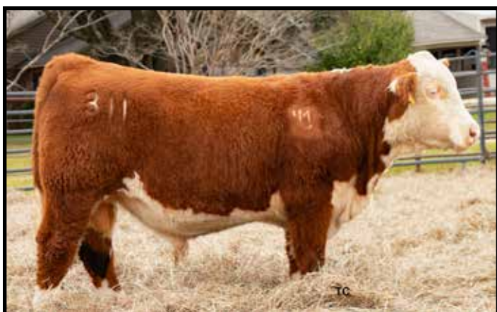
4M MR DEALER D2 311 ET

• 310 has true power and genuine shape, along with being in the top 7% for Fat and 6% for REA. These 666 sons never disappoint. He is also ranked in the top 14% for SCF and top 15% for BMI and BI. Whether you are sending calves to the rail or keeping daughters, these 666 sons can do it for you. Full brother to Lots 311 and 322.