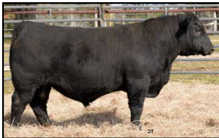
4M MR IMPRESSIVE CHARLO 394

• 394 is a deep, stout, rugged made bull. He has an impressive spread with lots of growth. He will add the pounds to your calves. Half brother to Lots 3X1, 330 and 350.