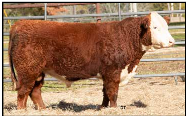
4M MR FORWARD VICTOR 349 ET

• 349 is powerful, rugged and stout. He has lots of growth and performance. He ranks in the top 16% for WW, 12% for YW and 7% for Fat. His dam records a progeny ratio of 5 @ 104.2 for YW. Full brother to Lot 328.