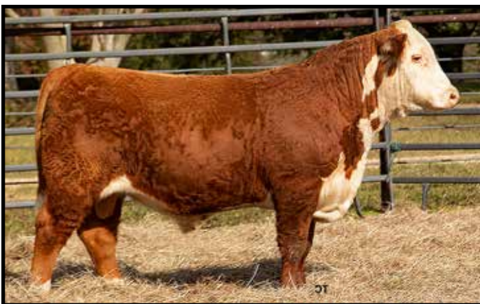
4M MR 9364 DENVERS MONEY 3100

• 397 is a heifer bull whose numbers speak for themselves. He is in the top 20% for CED, 13% for SCF, 14% BMI and 16% BI. Because of the older, proven genetics we think he would cross great on a commercial herd.