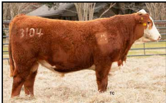
4M MR 2079 JC DOMINO 3104

• 3104 is a cherry red, goggled eyed horned bull. This 2079 son is short marked, genuine in his shape and design and fast growing! He ratioed a 103 for WW and 107 for YW, putting him in the top 7% for WW and YW.