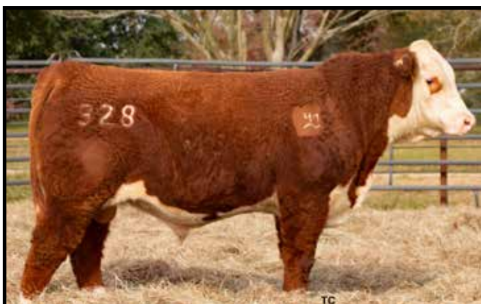
4M MR 252 VICTOR 328 ET

• 325 is another extremely powerful 666 son. 325 is a high performing bull with plenty growth. 325 ratioed 109 for WW and 103 for YW. His dam records a progeny ratio of 3 @ 102.7 for WW and 3 @ 101 for YW. He also excels in the top 2% for SCF, as well excelling in his carcass traits of 1% for REA, 2% for BI and 13% for BMI.