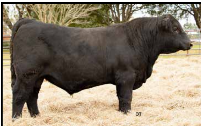
RM MR CHARLO MOUNTAIN 3X1

• 3107 may be the youngest bull, but don't count him out. This 2079 son goes back to a 10Y/294 daughter. He is a heifer bull, who is also big bodied, robust in his shape and sound. He ranks in the top 7% for SCF, 15% for BMI and BI. His dam also records a progeny ratio of 2 @ 101 for YW.