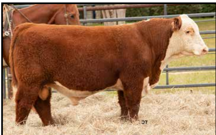
4M MR 666 D2 310 ET

• 309 is a stout, rugged and powerful bull. He is sired by our popular 111 bull and out of 923, who is our up-and-coming donor cow. 923 has already had calves ratio 103 for WW and YW. 309 is sure to inject power and pounds into his calves.