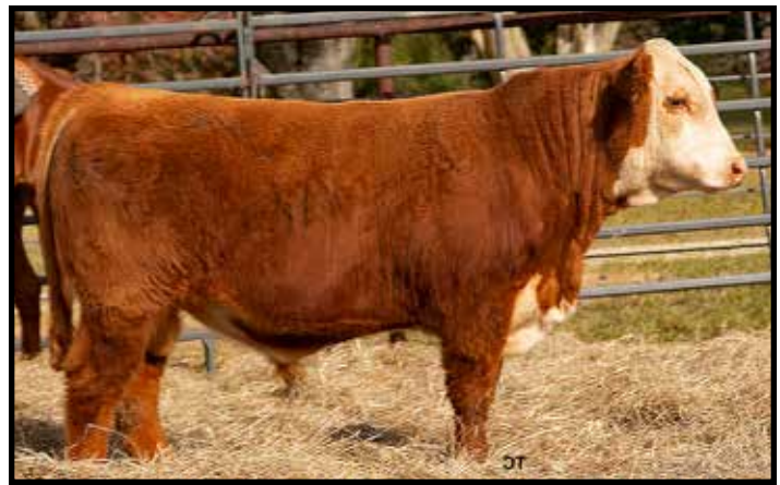
4M MR 322 REDMAN 347

• 347 is a heifer bull. He is big boned, stout and easy keeping. His pedigree goes back to our 021 donor who was very productive for us. 347 is in the top 8% for BW, 25% for DMI and 7% for Udder.