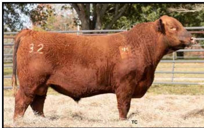
MG4M RED BANDERA 32E

• 32E is extremely expressive in his design. He is packed with longevity in his pedigree. He will cross well on any set of cattle.