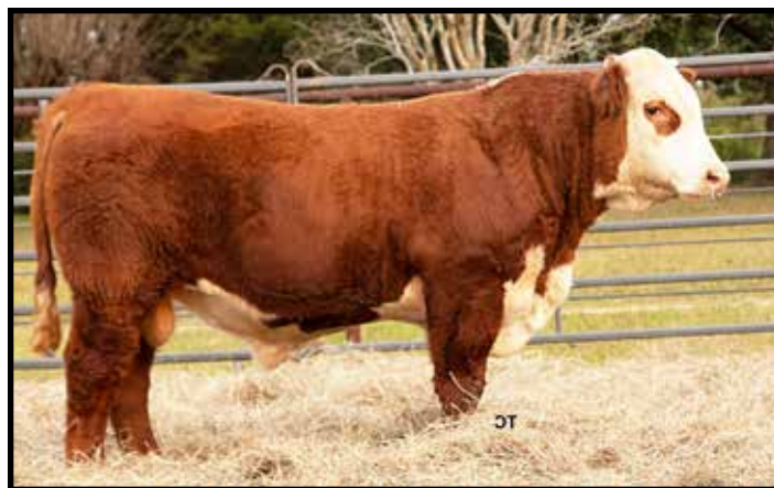
4M MR 322 FORWARD COWBOY 372

• 372 is stacked on the pedigree side with 66589, 252F, and out of our infamous 021 donor. Sleep at night heifer bull, that's dark red, red eyed and easy keeping. 372 ratioed a 104 for YW. He ranks in the top 6% for Udder and 11% for Teat.