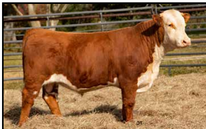
4M MR 9364 ADVANCE 388

• 388 is a heifer bull. Another 9364 son who has a sound genetic background in his pedigree. He ranks in the top 12% for SCF, 14% for BMI and 18% for BI. His dam ratioed 3 @ 103 for WW.