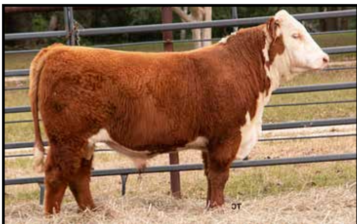
4M MR 9364 CASH FLO 377

• 376 is another 9364 son, whose dam is proving donor worthy. His dam has ratioed 4 @ 104.5 for WW and 3 @ 106.3 for YW. 376 is a heifer bull that is rugged, stout and built for the long haul. 376 ratioed a 101 for WW and 105 for YW.