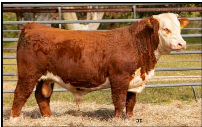
4M MR 111 ADVANCE 309 ET