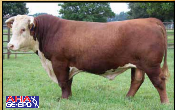
B&D L1 DOMINO 9364 ET Sire of Lots 353, 357, 366, 376, 377, 384, 388, 397, 3100, and 3105