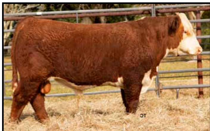
4M MR 322A SENSATION 318

• 318 is a heifer bull. His pedigree needs no introduction having 10Y, Trust 100W and Sensation in it. 318 ratioed a 102 for WW. He is a growthy power bull that can do it all. 318 ranks in the top 10% for BW and WW.