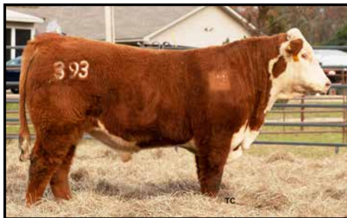
4M MR 88483 SENSATION 393

• 393 is a heifer bull. He is the only 88483 son in this offering, and his half-brothers were well received at our last sale. He also goes back to the well-known 021 donor. 393 is easy keeping, who is robust in his shape and design. He ranks in the top 13% for SCF, 15% BW, 20% for Udder and 11% for Teat. He will sire the kind you want to keep.