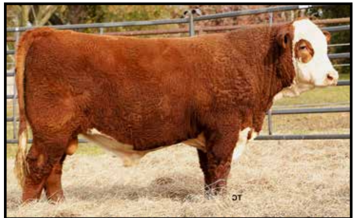
4M MR 2079 DOMINO DEALER 334