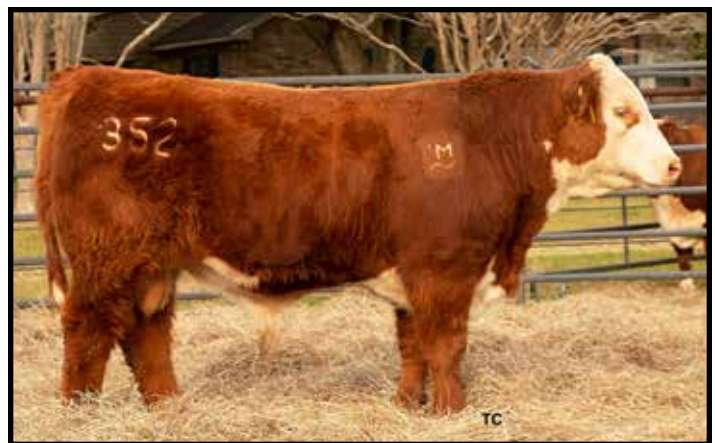
4M MR 322 RED RIDER 352

• 352 is a big-time heifer bull. He is a Mandate grandson backed by our U50 donor. He is in the top 20% for SC, 18% for SCF, 7% for Udder and 11% for Teat, 15% for Marbling and 20% for BMI and BI. He would be a great one on a set of commercial cows to keep replacements.