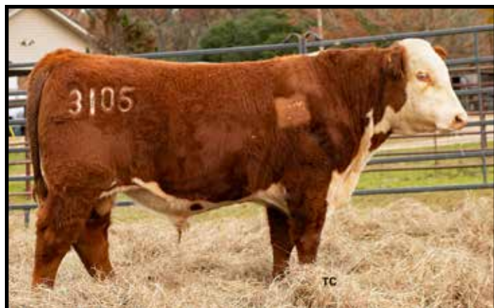
4M MR 9364 DOMINO 3105

• 3105 is a heifer bull who is sired by 9364. He is one of the last 9364 sons to be offered in this sale. 3105 is a solid made horned bull who is hard to pick a hole in. If you are needing longevity, he ranks in the top 4% for SCF, 5% BMI and 7% BI.