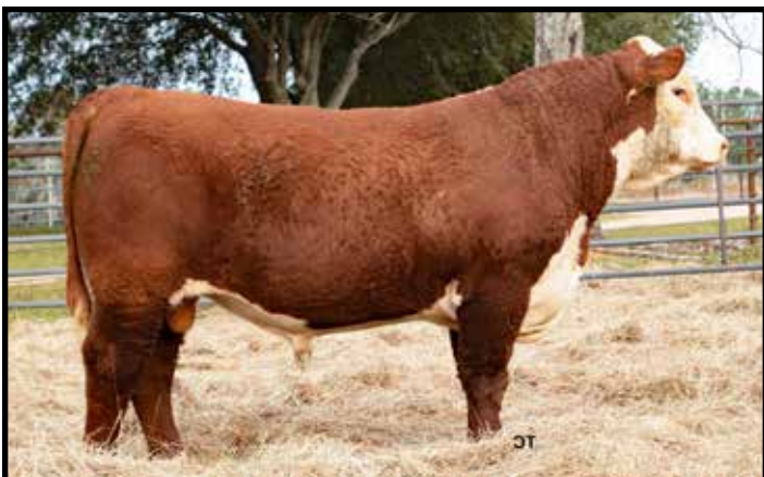
4M MR 55000 HAWK 342

• 339 is a heifer bull. His dam, 114S, played an important part in our herd building success. If you are looking to make replacements, 339 is the one. 339 ranks on the top 9% for SCF, 20% Udder, 10% Teat and 14% for BMI and BI. His dam records a progeny ratio of 10 @ 105 for WW and 6 @ 103 for YW.