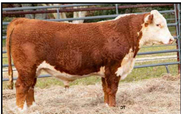
4M MR LEADER 310 360 ET

• 357 is a very complete and impressive 9364 son, who is a heifer bull candidate. His dam, 807, goes back to X420, one of our first donor cows. 357's phenotype of power, ruggedness and body are just a few of his attributes. He is in the top 1% for SCF, 20% for Udder, 3% for Teat, and 1% for BMI and BI. He ratioed a 104 for WW and 105.4 for YW. His dam records a progeny ratio of 3 @ 103.3 for WW and 3 @ 105 for YW. Use him on some Angus or Brahman cows for keeping great replacements.