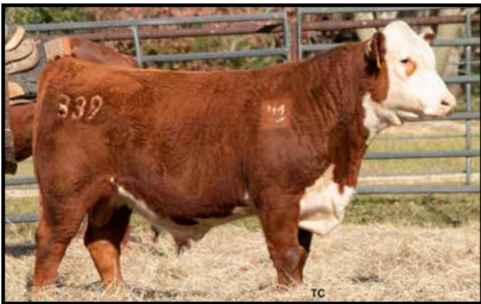
4M MR 2079 VICTOR 339 ET