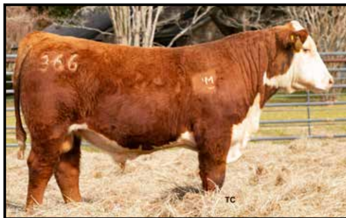
4M MR 9364 LARAMIE 366

• 366 is sired by 9364 and goes back to the 114S donor cow. His dam, 969, records a progeny ratio of 2 @ 106 for WW and 2 @ 102.5 for YW. 366 is powerful, short marked with good pigment. He ratioed a 108 for WW and 104 for YW being in the top 7% for WW, 17% for YW, 14% for SCF, and 11% for BMI and BI.