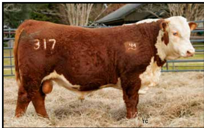
4M MR 111 ADVANCE 317

• 317 is another powerful 111 son. This easy keeping bull is built to go out and get the job done. 317 ratioed a 107 for WW with a solid set of EPD numbers. His dam records a progeny ratio of 3 @ 106 for WW and 2 @ 103 for YW.