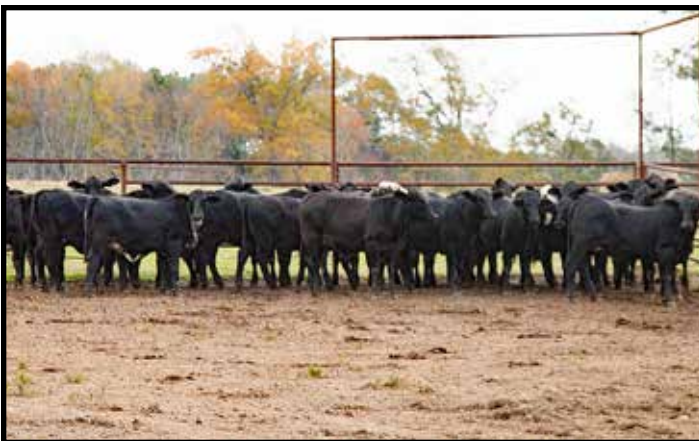
MG-4M BLACK F1 HEIFERS

14- to 16-month-old heifers. Exposed to low-birth-weight Angus bull starting December 28, 2023. Vaccinated on December 1, 2023 with Virashield 6VL5HB and dewormed with Dectomax injectable.